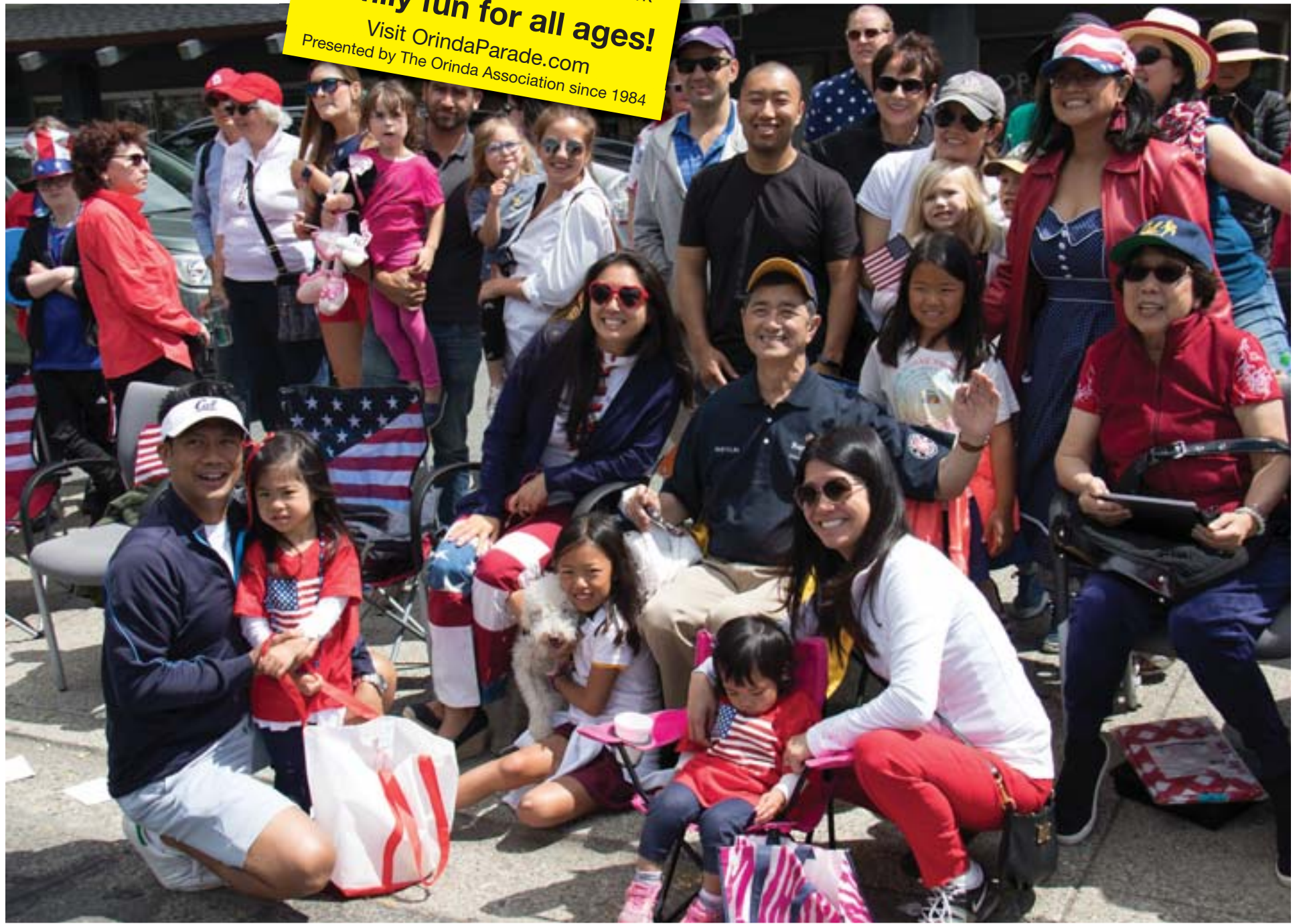
Many families came out to celebrate dressed in red, white and blue at last year's parade.