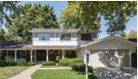
2532 Vernado Camino, Walnut Creek SELLER REP. $1,095,000