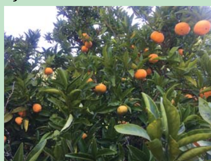
A tree filled with tangerines kissed by honeybees.

PRUNE "widow makers" – dead branches on trees. You can identify the dead branches before the leaves fall from the rest of the tree.