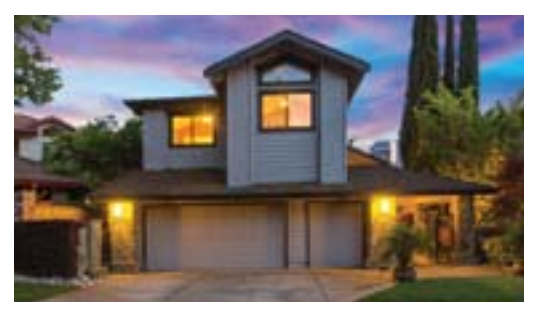
143 Birchbark Place, Danville (Blackhawk) 4 Bedrooms, 3.5 Bathrooms, 3,062 sf, 5,200 sf lot NEW PRICE! Offered at $1,675,000

Matt McLeod, REALTOR ® DRE 01310057 925.464.6500 · matt@dudum.com