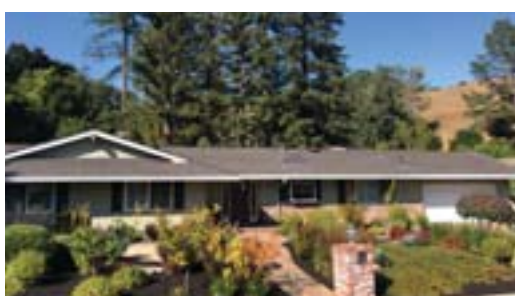
2 Ashbrook Place, Moraga 4 Bedrooms, 2 Bathrooms, 2,244 sf, .35 acre flat lot JUST LISTED! Offered at $1,595,000