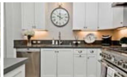
1003 Woodbury Rd. No. 207, Lafayette SELLER REP. $995,000

*Also Available: 3419 St. Marys Road, Lafayette | $995,000 For Lease: 432 Stonefield, Moraga | $5,300