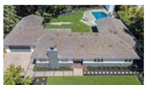
60 Santa Rita Drive, Walnut Creek BUYER REP. $1,650,000