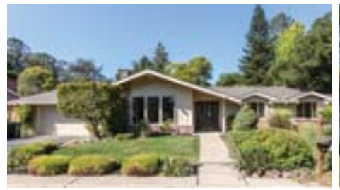
105 Devin Drive, Moraga SELLER REP. $1,295,000