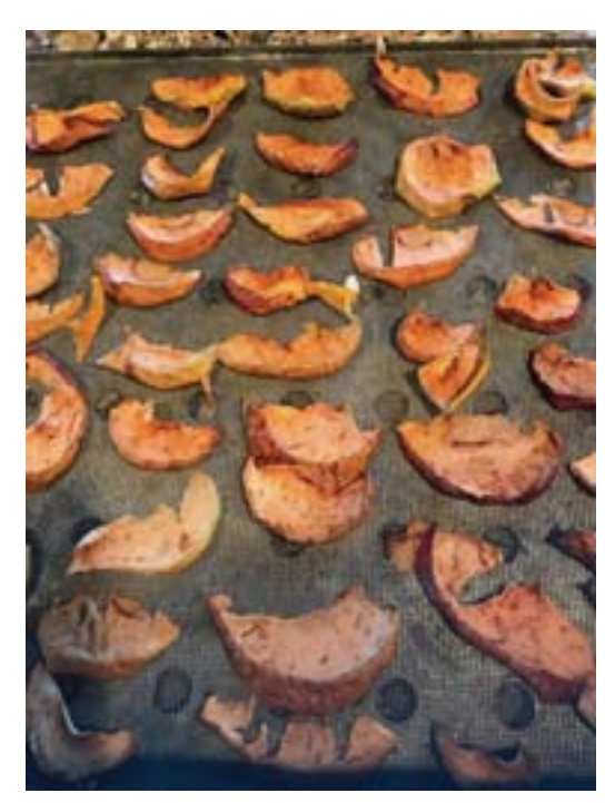
The dried apples cool down after dehydration.

As summer slowly fades into fall, I wish you abundance and a garden of eating.