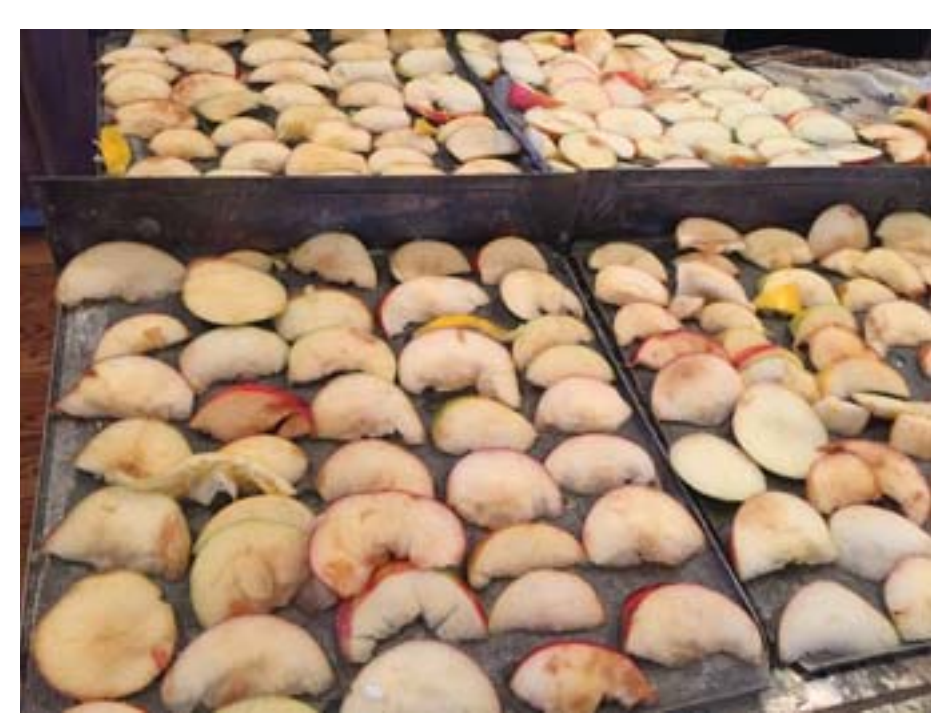
Sliced apples on the dehydrator trays.