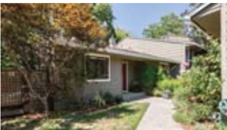
716 Augusta Drive, Moraga SELLER REP. $845,000