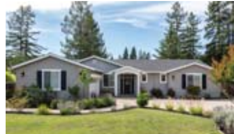
2 Altarinda Circle, Orinda SELLER REP. $2,150,000