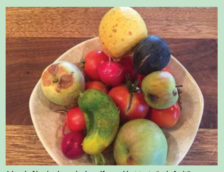
A bowl of bruised, cracked, malformed but tasty "ugly fruit".