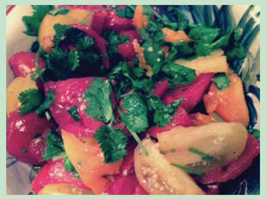
Tomatoes tossed with cilantro for an end of summer salad.