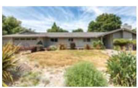
30 Chapel Drive, Lafayette BUYER & SELLER REP. $1,375,000