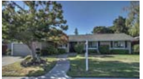
140 Walford Drive, Moraga BUYER REP. $1,395,000