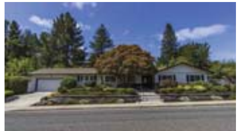
122 Corliss Drive, Moraga