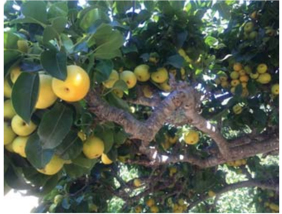
Asian Pears are bountiful.

While cleaning out one of our barns this summer, I came upon a vintage portable dehydrator that my grandfather used eons ago to dry his autumn bounty of pears, apples, figs and grapes. I cleaned the appli-