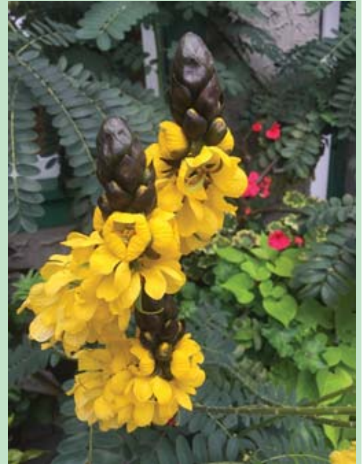
The plant that stumped Cynthia Brian: a tropical popcorn plant.