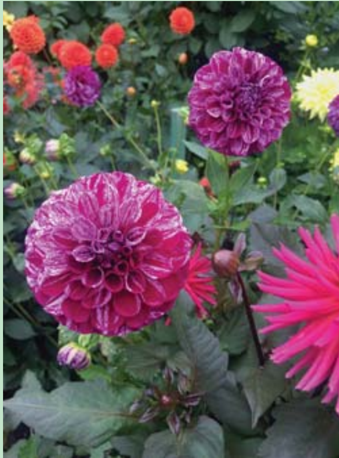
A border of dahlias of many varieties and sizes were in full bloom.