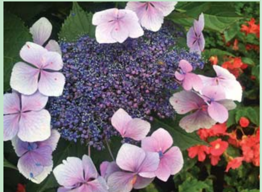
Look closely to see the honeybee on this rare violet lace cap hydrangea.