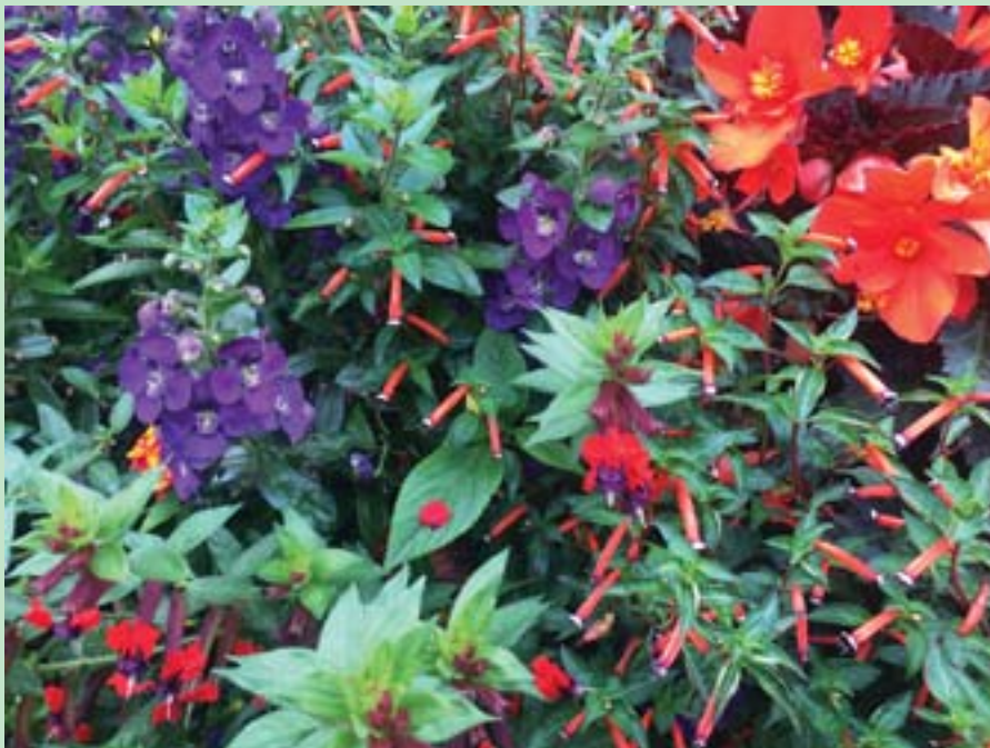
A colorful collage of Cuphea, the cigar plant with Angelonia, and tuberosa orange begonias.