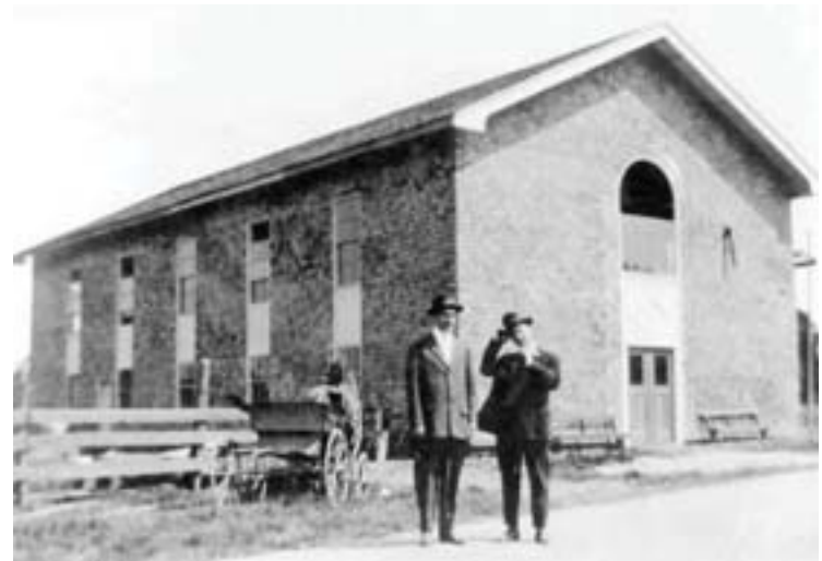
Town Hall early days Photo provided