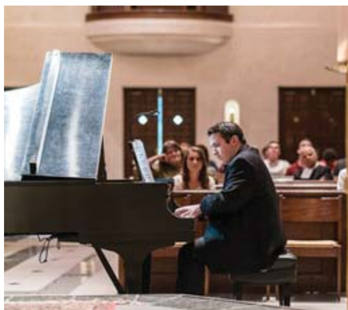
Music fills the Saint Mary's College Chapel at a previous recital.