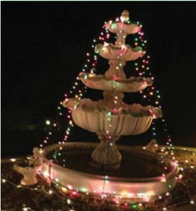
A festive fountain is lit for Christmas.