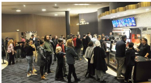
Updated lobby with the new concession stand on Thursday night.

In keeping with the décor of the circa 1957 era when The Rheem Theatre was born, the new owners have maintained the ambiance with a multitude of upgrades. The Dec. 19 grand reopening was a huge success.