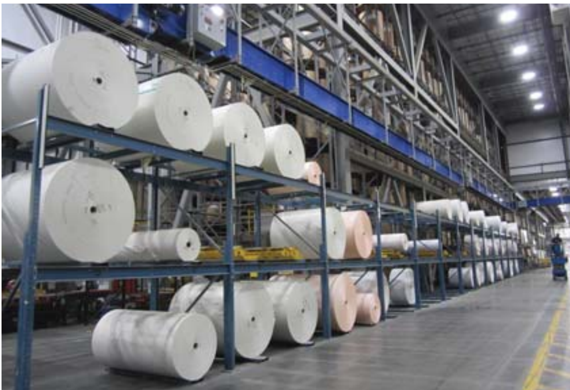
Giant rolls of paper