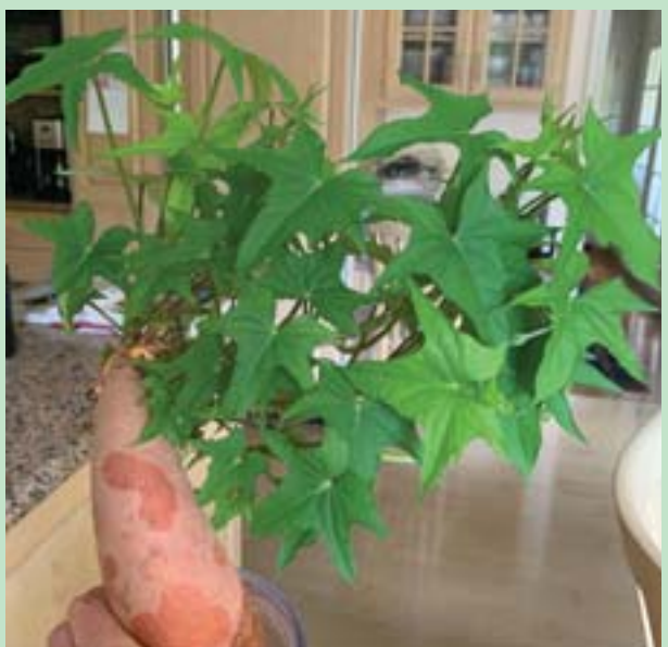
Yam growing in a glass jar can be planted in the garden.