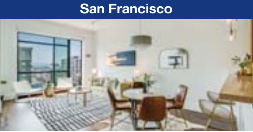
818 Van Ness Ave #804 $999,999

Penthouse w/City views. Building offers roof-top BBQ & entertaining area.