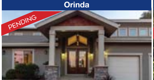
2 Camino Del Cielo

Privacy and security in your own 5-acre county estate 510-499-709 Yan Heim Yanheim.com Lic #01965925