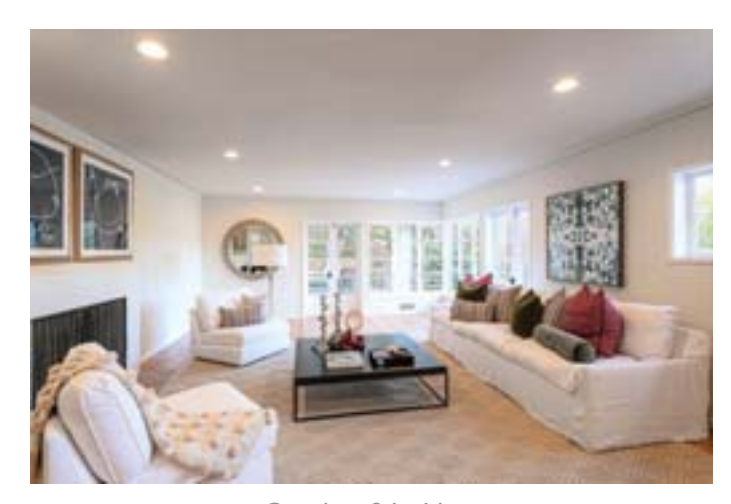
Orinda \sim 9 \ La \ Noria SF 3,034 | BD 3 | BA 3 | Bonus Room | AC .48 | Car Gar 2 | $1,645,000 Located in Orinda's coveted Country Club neighborhood, this updated home on a private, park-like setting offering lush gardens and picturesque outdoor areas under a canopy of mature oaks and shade trees.

Happy New Year! 2021 is here and all indications point to a robust market. The new year seems to be starting off like we ended 2020, with Lamorinda properties being in high demand. Give us a call so we can get a jumpstart on preparing your home for sale or help you find your dream home.