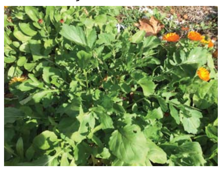
Arugula is easy to grow from seed.