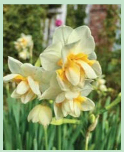
Close up of jonquil. One stem will perfume a room.