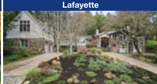
1201 Cambridge $3,195,000

mostly flat lot. Delightful! Laura Abrams 510-697-3225