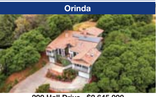
200 Hall Drive $2,645,000

20haciendacircle.com Lic#00878893/01272382