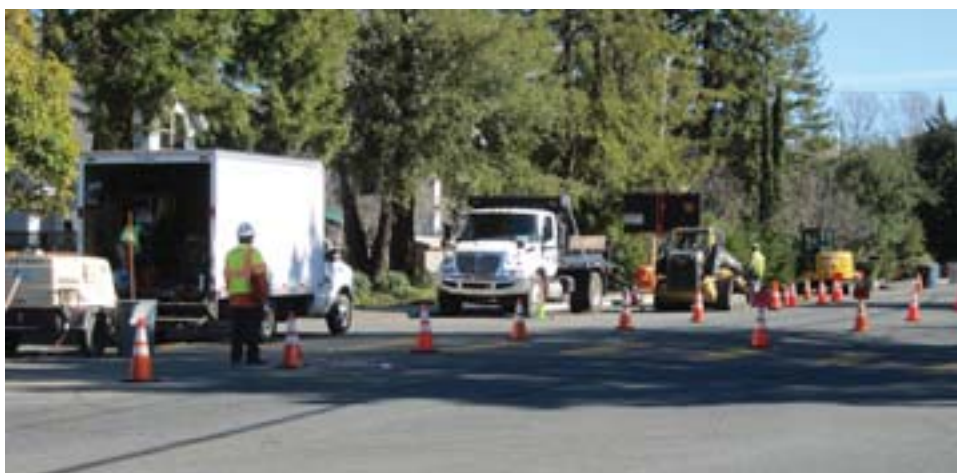
PG&E roadwork on Camino Pablo across from JMIS