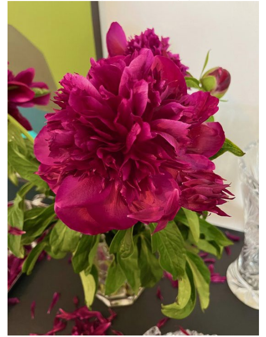
Pretty peonies only last a few days in a vase.