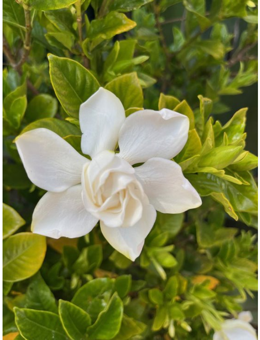
The sweet-smelling gardenia is a joyous June bloomer.