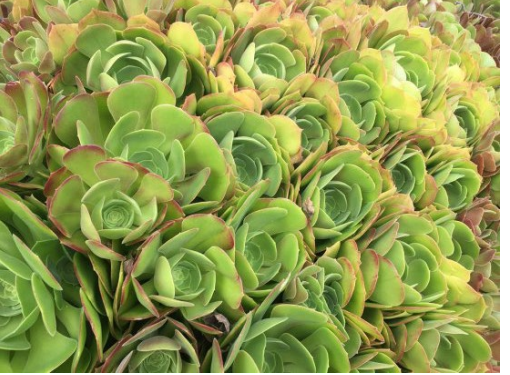
Aeoniums cluster to form a spectacular canvas.