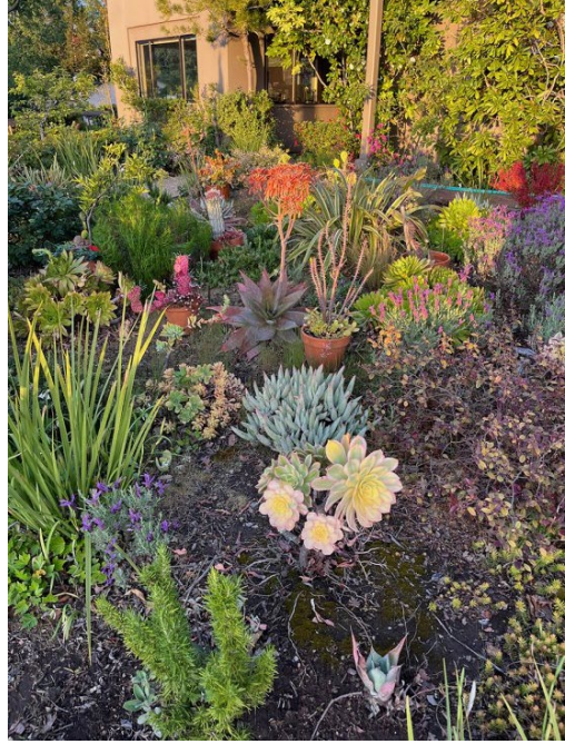
A kaleidoscope of succulents offers texture and form in a garden.