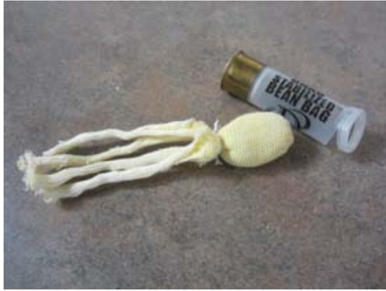
Bean bag projectiles