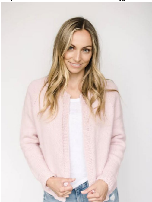
Knit-a-long Cardi at Busy Stix in Lafayette.