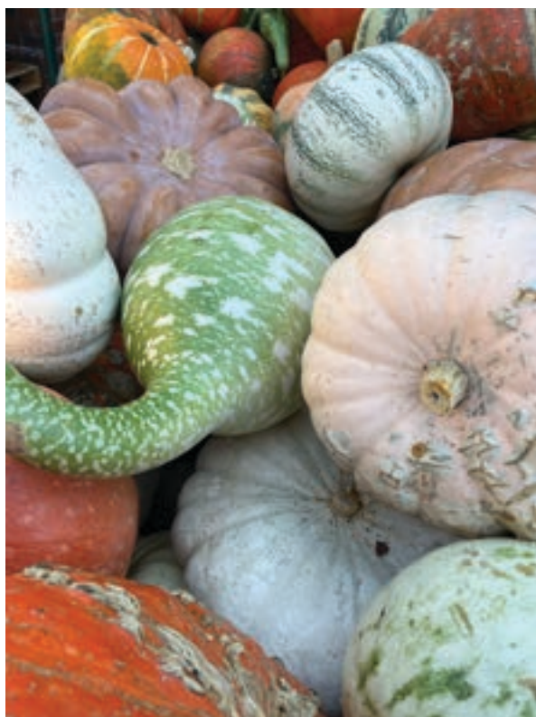
Pumpkins and gourds are piled high for fall.