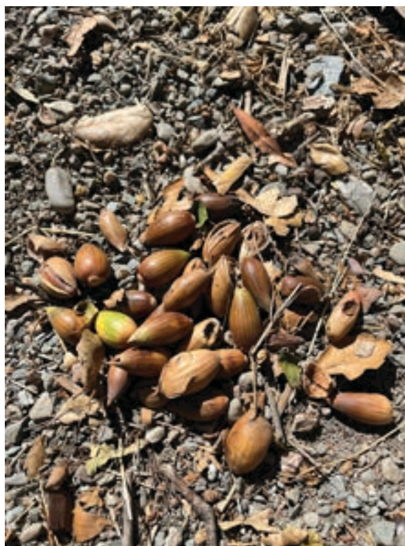
Squirreling away acorns for winter!