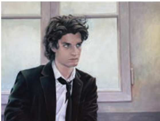
"White Window" by Nicole Reader