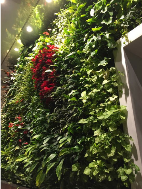
Living green walls are trending for 2023.