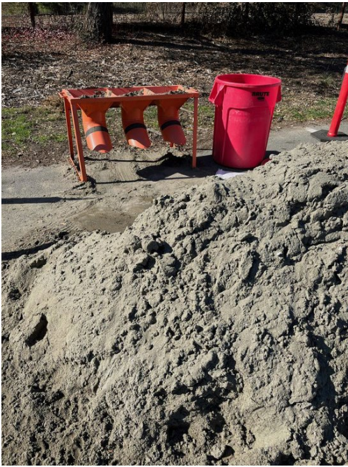
Fill sandbags to help with flooding and downpours.