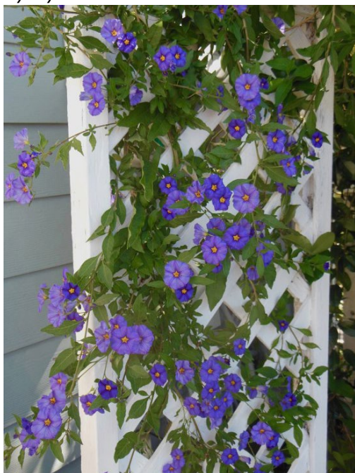
Vertical gardening with a potato vine climbing up a trellis.

"To plant a garden is to believe in tomorrow." ~ Audrey Hepburn