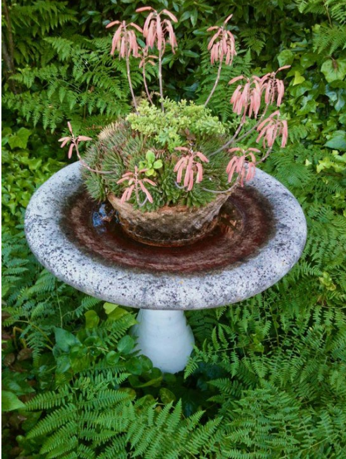
A basket of succulents set in a birdbath amongst ferns.

To ensure there is sufficient sand and bags available, they request citizens to please take only what is needed for actual or threatened flooding. Sandbags can also be obtained from local home improvement stores for a nominal price.