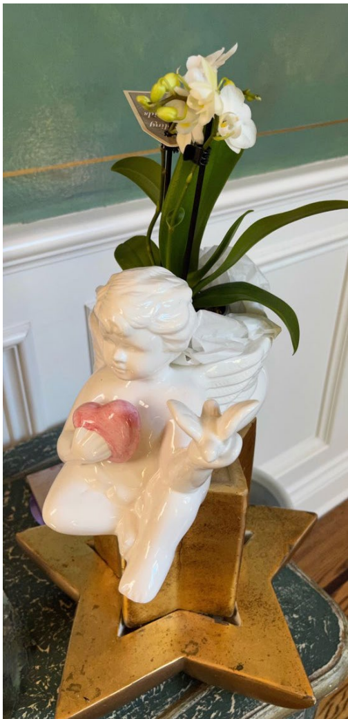
A white orchid lives in an angelic container.