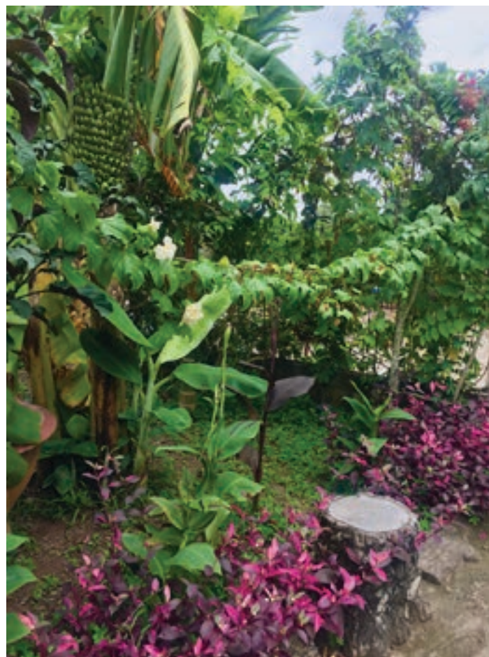
A small space boasts an elaborate tropical garden.

When it comes to plants, tropical and exotic are the favorites for all age groups. Orchids, bromeliads, anthuriums, birds of paradise,