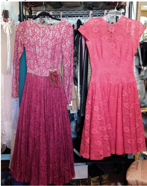
Dresses in shades of Magenta available at Divine Consign.

Viva Magenta is the color of the year, says Pantone Color Institute, the company behind the standardized color matching system. Magenta comes from the red family and it is described by Pantone as a shade with "vim and vigor" and is "expressive of a new signal of strength." Inspired by nature, more specifically the cochineal beetle, Viva Magenta is meant to reflect strength, power, and compassion in our ever more stressful and challenging world.