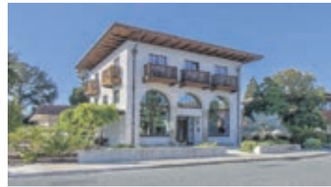
925 Country Club Drive, Moraga, CA 94556