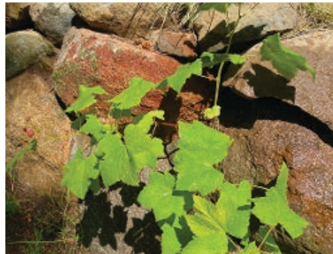
The thimbleberry, a thornless relative of raspberries and blackberries, is a delicious treat for humans and animals.