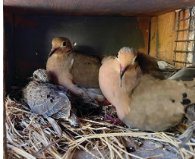
Mourning doves with their baby in a nest.

On Saturday, Sept. 30, Be the Star You Are!® will host a booth sponsored by the Lamorinda Weekly Newspaper and MBjessee Painting at the Pear and Wine Festival in Moraga. Stop by to plant seeds and pick up bags of free potpourri. More info at www.bethestaryouare.org/events-1/2023-pear-and-wine-festival