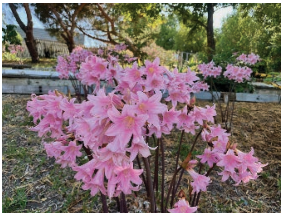
A hillside of Naked Ladies.