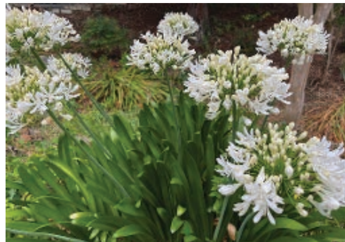
White agapanthus will be divided after flowering.

I didn't adopt the adorable miniature ponies because the family decided to keep them (smart move), yet I am forever grateful for that single division of the Naked Lady as these belladonnas have brought such beauty to my landscape and the gardens of others. Divide, share, and be happy!