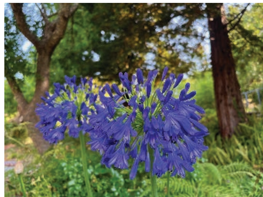
Midnight blue agapanthus.