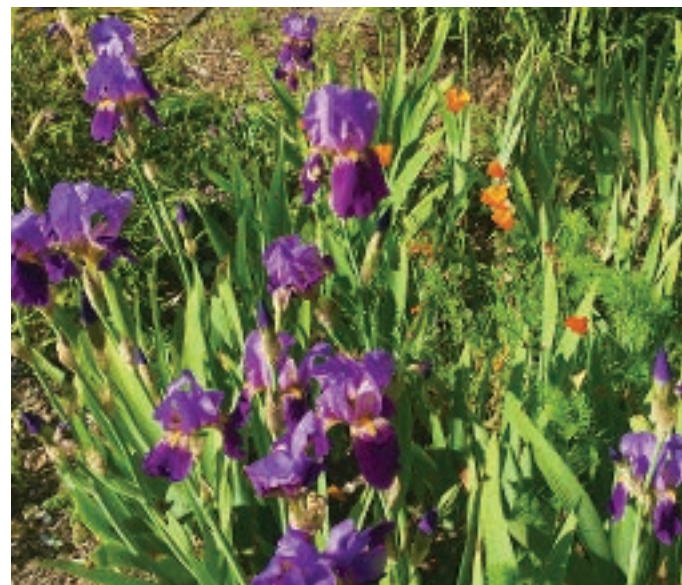
This bed of purple iris will be divided.