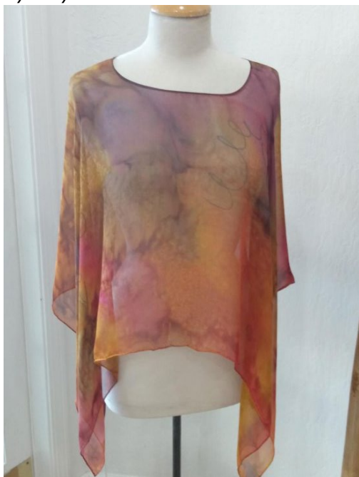
Hand painted silk top by Natasha Silk Art.