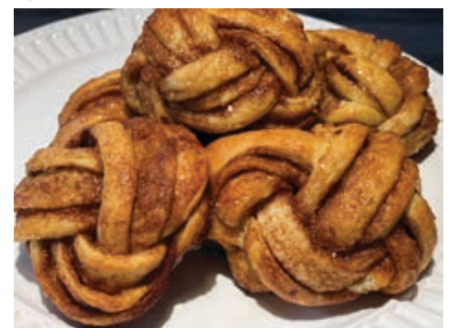
Cinnamon Roll Knots

If you've never made cinnamon rolls, it's a fun project and super satisfying. These cinnamon knots, filled with plenty of brown sugar-cinnamon butter are not only ridiculously tasty but also beautiful and really, really fun to make. If you know how to braid, you can make these rolls. Gooey on the inside with