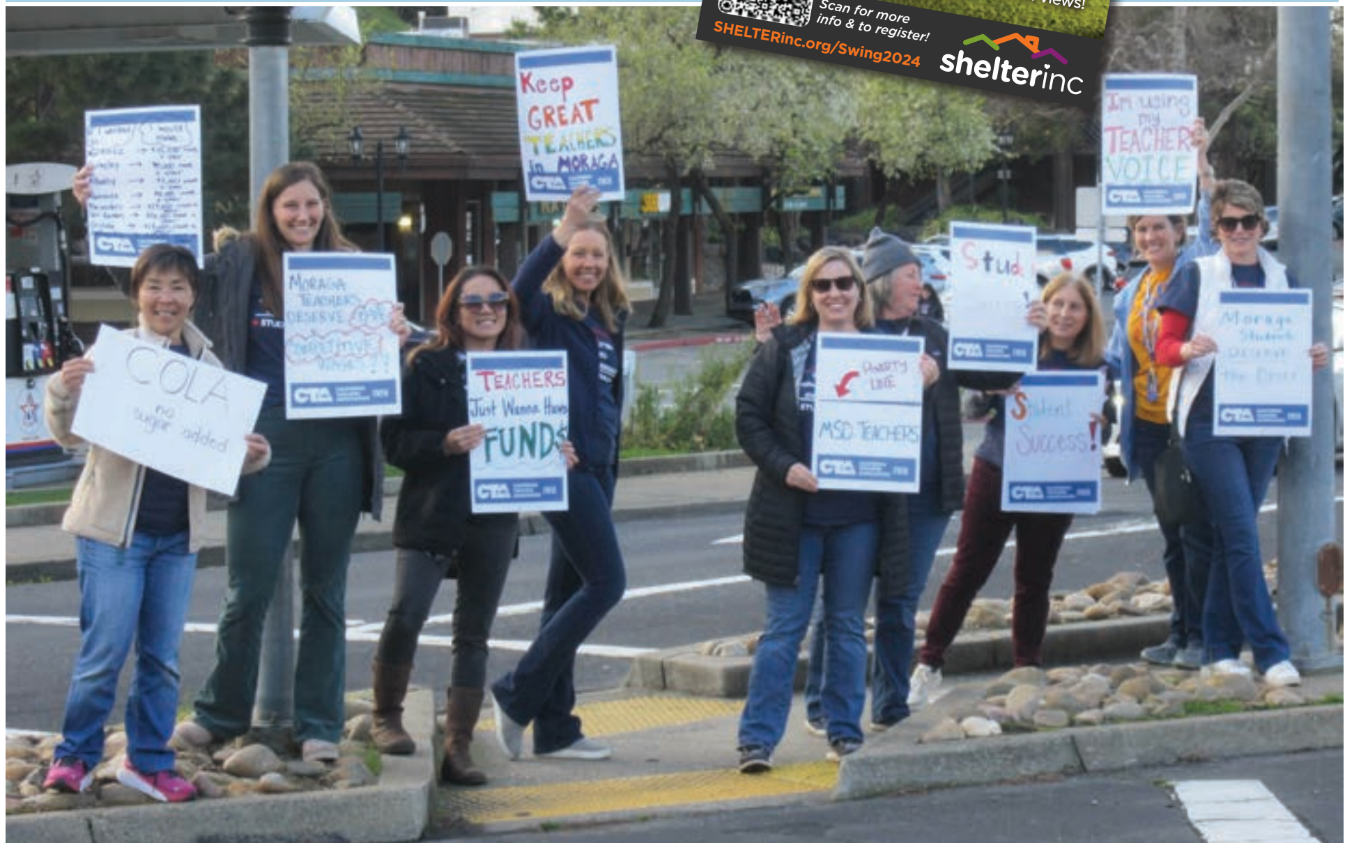
Moraga Teachers Association members hold a Feb. 21 rally at the Rheem Boulevard/Moraga Road intersection.