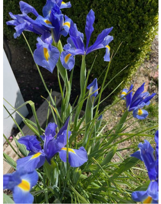
Blue Dutch iris.