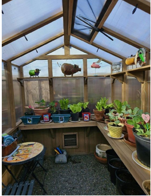
Get a head start with seedlings in a greenhouse.