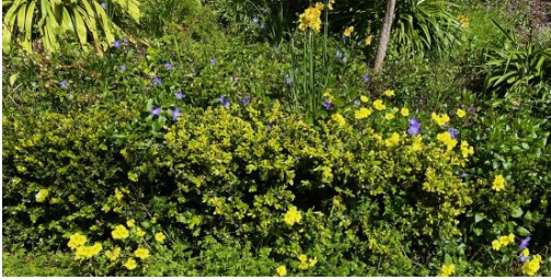
A yellow and blue odyssey of boxwood, oxalis, and periwinkle.