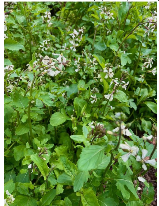
Edible flowers of arugula.

Plant a container with freesia, cyclamen, stonecrop, and a small palm.