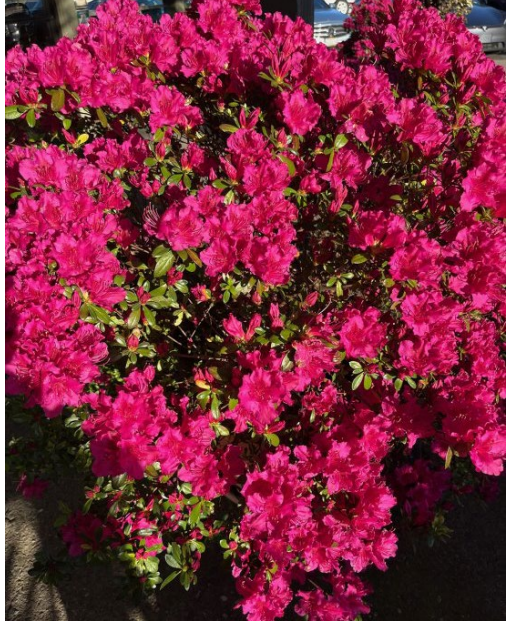
This fluorescent pink azalea blooms in a pot.