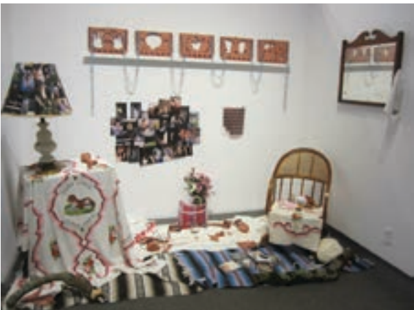
Celeste Xictlactli Escobedo