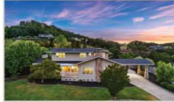
108 Oak Road, Orinda 4 Bd | 3 Ba | 3377 Sqft | $2,995,000

Totally renovated & updated in 2013, this light filled 6 bd/ 4.5 ba w/ bonus room & possible au-pair suite is a fabulous place to call home.