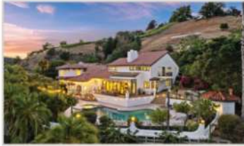
60 Coachwood Terrace, Orinda 7 Bd | 5.5 Ba | 6602 Sqft | $6,995,000

This secluded 7 bd/ 5.5 ba property offers views & a European vibe w/ close to town convenience & excellent schools!