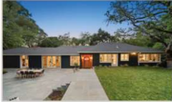
20 El Patio, Orinda 6 Bd | 4.5 Ba | 4552 Sqft | $2,995,000

Fabulous home in coveted Sleepy Hollow w/ wonderful floor plan & spectacular private backyard!