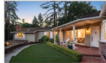
1087 Rahara Drive, Lafayette 3 Bd | 3 Ba | 2685 Sqft | $2,595,000

Stylish retreat in Happy Valley hills w/ views from every room! 3771 sq ft, 4 bd + office, pool, wine room & greenhouse on 1+ acre!