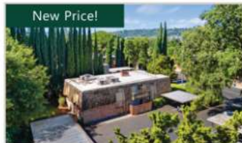
New Price! 2714 Jones Road, Walnut Creek 4 Units | 3986 Total Sqft | $1,895,000

This secluded country horse ranch fts 10.51 acres w/ a 3,472 sf main house, 1,018 sf guest house, a 2-stall barn, a 5,400 sf arena + more!