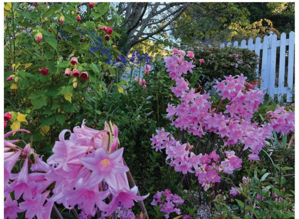
With blue agapanthus and red-veined Chinese lantern as a background, Naked ladies are magical.

Amaryllis belladonna is the botanical name of the flower, "Naked