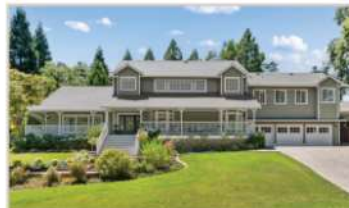
488 El Alamo, Danville 4+ Bd | 4 Ba | 4110 Sqft | $3,850,000

Built in 1970 this 4 unit complex is conveniently located off the I-680 freeway, is fully rented & ready to produce a profit!