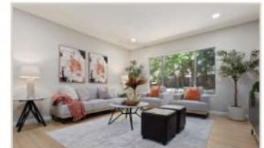
1167 Kaski Lane, Concord 4 Bd | 3 Ba | 2237 Sqft | $1,199,000

On a private lot, set within a verdant garden oasis, this Montclair gem offers modern luxury & tranquility!