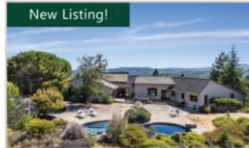
New Listing! 3930 Quail Ridge Road, Lafayette 4 Bd | 2.5 Ba | 3771 Sqft | $3,085,000

Va-Va-Views! This stylishly updated Orinda home is immersed in nature & a peaceful escape, yet right in town.