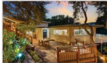
76 La Cuesta Road, Orinda 3 Bd | 2 Ba | 1762 Sqft | $1,495,000

Bright 5 bd/2.5 ba home in Orinda w/ amazing views!