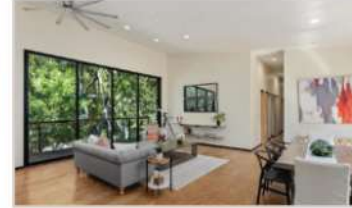
417 Moraga Way, Orinda 4 Bd | 2 Ba | 2007 Sqft | $1,695,000

Nestled in the Sleepy Hollow neighborhood, this spectacular property includes a 4 bd/ 2.5 Ba main home + a 1 bd/ 1 ba cottage.