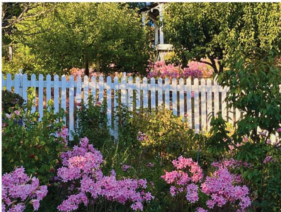
The hillside and orchard are filled with stunning Amaryllis belladonna , Naked ladies.