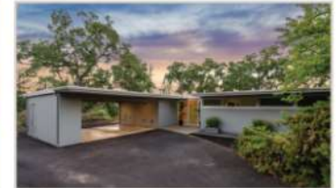
3580 Boyer Circle, Lafayette 3 Bd | 2 Ba | 2158 Sqft | $1,795,000

This expansive 3 bd/ 3 ba home spans 2,685 sf on a generous 0.56-acre lot in the coveted Happy Valley neighborhood.