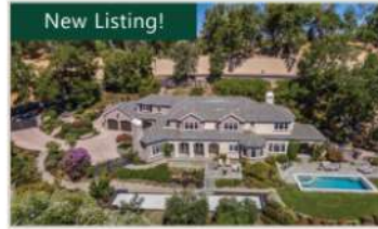
New Listing! 27 Orinda View Road, Orinda 5 Bd | 5.5 Ba | 5335 Sqft | $5,150,000

Magically set in an heirloom garden is this stunning, private, one of a kind Classic Orinda Country Club home!