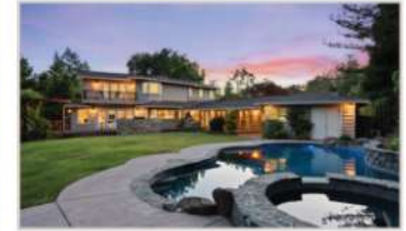
188 Lombardy Lane, Orinda 5 Bd | 4 Ba | 3948 Sqft | $3,495,000

This exquisite home combines luxury, comfort, quality, privacy, & convenience to SF & top tier Orinda schools.