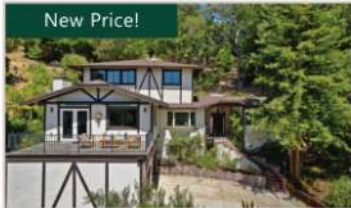
New Price! 53 Via Floreado, Orinda 5 Bd | 2.5 Ba | 2851 Sqft | $1,575,000

Located in the prestigious Orindawoods, this 3 bd/ 3 ba, modern light-filled townhome is stunningly updated & has it all!