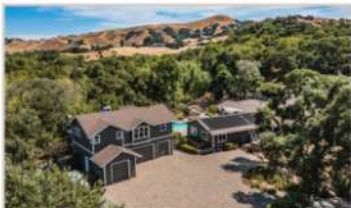
1031 Bollinger Canyon, Moraga 5 Bd | 3.5 Ba | 4571 Sqft | $2,795,000

Fall in love with this beautifully updated, 4 bd/ 3 ba, single-level home with an ideal layout!