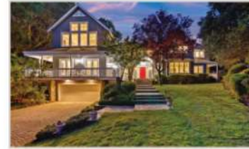
291 Monte Vista Ridge Road, Orinda 5 Bd | 4.5 Ba | 5576 Sqft | $4,250,000

This private 5 bd/ 5.5 ba retreat is above it all offering unobstructed sweeping views out nearly every window!