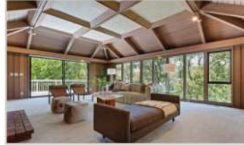
43 Bear Rodge Road, Orinda 5 Bd | 3.5 Ba | 3571 Sqft | $2,250,000

Built in 2000 & nestled in one of Orinda's close to town neighborhoods, this bright spacious home has everything you are looking for!