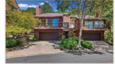
152 Ravenhill Road, Orinda 3 Bd | 3 Ba | 2546 Sqft | $1,595,000

Thoughtfully designed custom home offers gorgeous views & abundant natural light from a wall of multi-sliders!