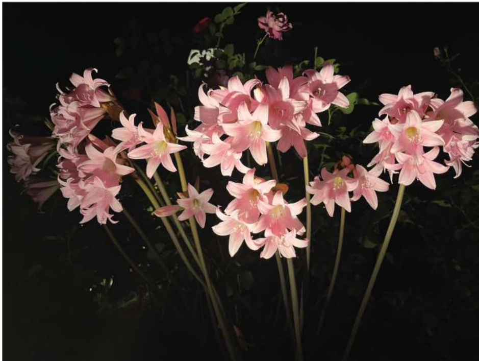
Lighter pink Naked ladies shine at night.