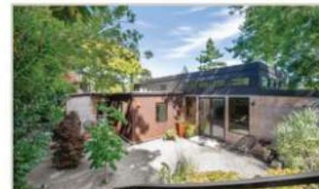
6915 Ridgewood Drive, Oakland 3 Bd | 2 Ba | 1464 Sqft | $1,495,000

Nestled in Danville's desirable El Pintado neighborhood, this 4 bd/ 4 ba Farm House Estate has been completely remodeled!