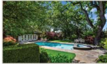
33 La Noria, Orinda 5 Bd + Office | 4.5 Ba | 5267 Sqft | $5,500,000

This secluded 7 bd/ 5.5 ba property offers views & a European vibe w/ close to town convenience & excellent schools!