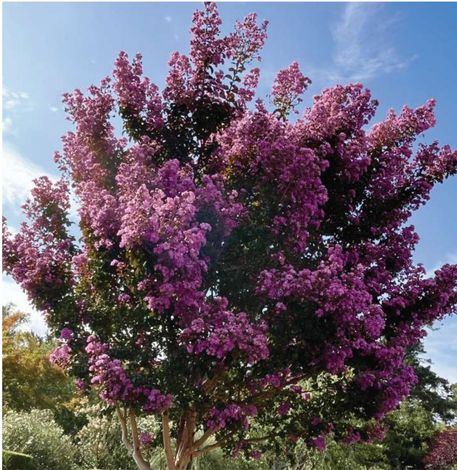
A purple crape myrtle is full of flowing flowers.

"Gardening is a way of showing that you believe in tomorrow" Audrey Hepburn