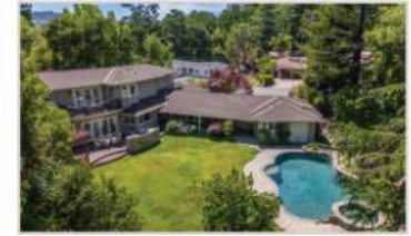
188 Lombardy Lane, Orinda 5 Bd | 4 Ba | 3948 Sqft | $3,495,000

In the heart of the OCC neighborhood, this custom 4 bd/ 3 ba home offers breathtaking views from the glass walled veranda!