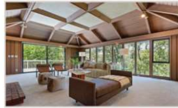
43 Bear Rodge Road, Orinda 5 Bd | 3.5 Ba | 3571 Sqft | $2,250,000

Located at the end of a cul-de-sac on a generous .67 acre, this home enjoys over 4000 sqft of living w/ a pool & sports court!