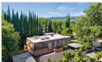
2714 Jones Road, Walnut Creek 4 Units | 3986 Total Sqft | $1,895,000

Completely updated, charming single-level townhome on a private court in the heart of the Moraga Country Club!