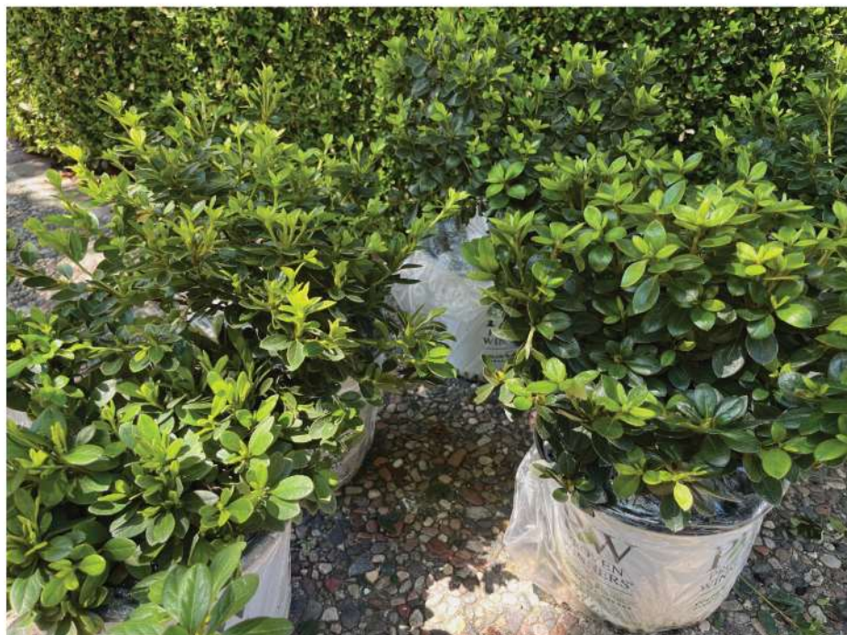
Azaleas from Spring Meadow's Proven Winner waiting to be planted in fall.

Angel trumpet flower, Brugsmansia aurea, in yellow.