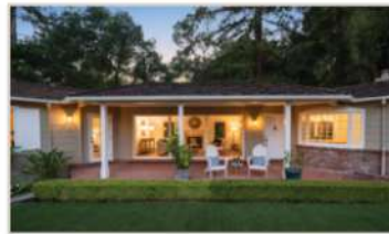
1087 Rahara Drive, Lafayette 3 Bd | 3 Ba | 2685 Sqft | $2,595,000

Stylish retreat in Happy Valley hills w/ views from every room! 3771 sq ft, 4 bd + office, pool, wine room & greenhouse on 1+ acre!