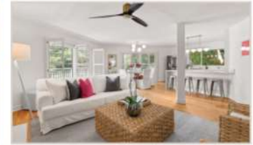
76 La Cuesta Road, Orinda 3 Bd | 2 Ba | 1762 Sqft | $1,495,000

Located in the prestigious Orindawoods development this modern light-filled townhome is stunningly updated & has it all!