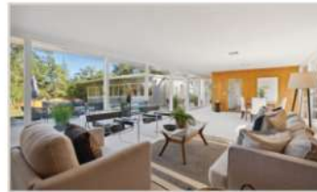
3580 Boyer Circle, Lafayette 3 Bd | 2 Ba | 2158 Sqft | $1,795,000

This expansive 3 bd/ 3 ba home spans 2,685 sf on a generous 0.56-acre lot in the coveted Happy Valley neighborhood.