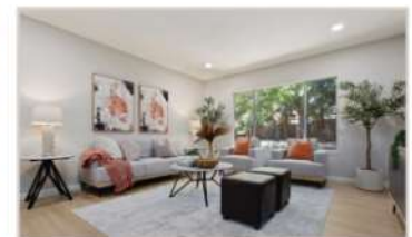
1167 Kaski Lane, Concord 4 Bd | 3 Ba | 2237 Sqft | $1,199,000

This sleek Hiller Highlands townhome seamlessly combines comfort & style w/ its functional split-level design.