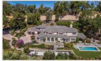
27 Orinda View Road, Orinda 5 Bd | 5.5 Ba | 5335 Sqft | $5,150,000

This secluded 7 bd/ 5.5 ba property offers views & a European vibe w/ close to town convenience & excellent schools!