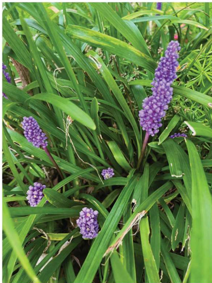
Purple muscari blooming in September.

If you'd like to pick up free seeds and potpourri, visit me at the 2024 Nonprofit of the Year's Be the Star You Are!® booth on Sept. 28 at the Pear