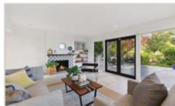
6915 Ridgewood Drive, Oakland 3 Bd | 2 Ba | 1464 Sqft | $1,495,000

A rare opportunity for country club living in this expansive home within walking distance of the prestigious Round Hill Country Club!