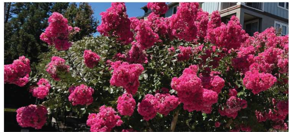
A multi-trunk watermelon-hued crape myrtle tree.

Root Development: Speaking of roots, with the soil still warm from sum-