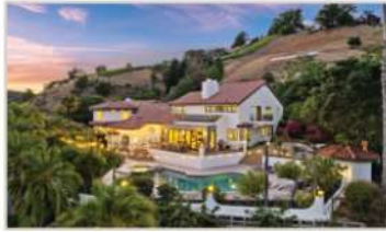
60 Coachwood Terrace, Orinda 7 Bd | 5.5 Ba | 6602 Sqft | $6,995,000

This secluded 7 bd/ 5.5 ba property offers views & a European vibe w/ close to town convenience & excellent schools!