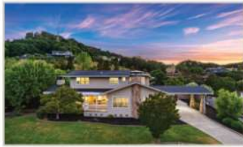
108 Oak Road, Orinda 4 Bd | 3 Ba | 3377 Sqft | $2,995,000

Fabulous home in coveted Sleepy Hollow w/a wonderful floor plan & spectacular private backyard!