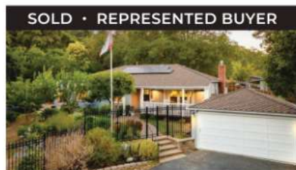
SOLD • REPRESENTED BUYER

11 BAY FOREST, OAKLAND SOLD FOR $1,260,000 L. LEGLER & C. HATA | 925.286.1244