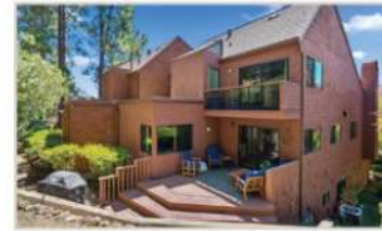
152 Ravenhill Road, Orinda 3 Bd | 3 Ba | 2546 Sqft | $1,550,000

Nestled in the Sleepy Hollow neighborhood, this spectacular property includes a 4 bd/ 2.5 Ba main home + a 1 bd/ 1 ba cottage.