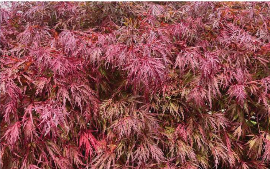
Acer Palmatum-Crimson Cut Leaf Japanese Maple shines brightly.