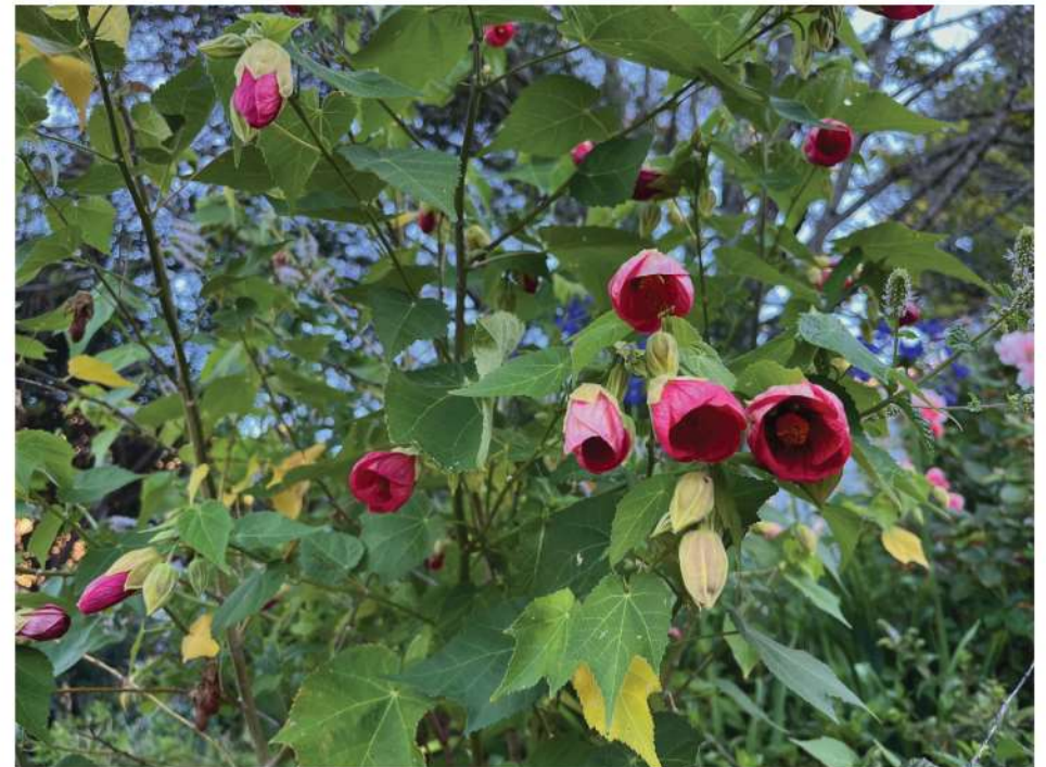
Chinese lanterns, Abutilon 'nabob, attract butterflies, bees, and hummingbirds.

Only two weeks until autumn officially arrives. With the intense heat of this past summer, a cooler fall offers a welcome prescription to plant. The summer sun fried the leaves on many plants. On the hottest days, I installed umbrellas to shade my gardenias, heucheras, geums, and penstemons. Since July when temperatures were blazing, I have positioned 30 containers of Proven Winners reblooming azaleas snuggled under the canopy of my camellia tree awaiting optimal weather for final situating. Because all newly planted specimens need ample water and mild warmth