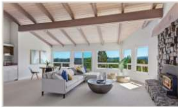
3930 Quail Ridge Road, Lafayette 4 Bd | 2.5 Ba | 3771 Sqft | $3,085,000

Va-Va-Views! This stylishly updated Orinda home is immersed in nature & a peaceful escape, yet right in town.