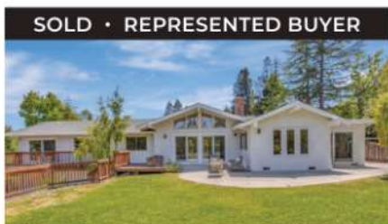
SOLD • REPRESENTED BUYER

17 HAMMOND PLACE, MORAGA SOLD FOR $1,600,000 MATT MCLEOD | 925.465.6500