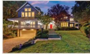
291 Monte Vista Ridge Road, Orinda 5 Bd | 4.5 Ba | 5576 Sqft | $4,250,000

This private 5 bd/ 5.5 ba retreat is above it all offering unobstructed sweeping views out nearly every window!