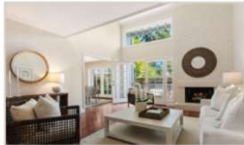
655 Augusta Drive, Moraga 2 Bd | 3.5 Ba | 2352 Sqft | $1,495,000

Luxury single-level condo on a cul-de-sac features hardwood flooring, beamed ceilings, Anderson windows & so much more!