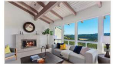
3930 Quail Ridge Road, Lafayette 4 Bd | 2.5 Ba | 3771 Sqft | $2,850,000

Va-Va-Views! This stylishly updated Orinda home is immersed in nature & a peaceful escape, yet right in town.