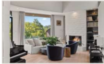
523 Miner Road, Orinda 5 Bd | 4 Ba | 3945 Sqft | $3,750,000

This exquisite home combines luxury, comfort, quality, privacy, & convenience to SF & top tier Orinda schools.