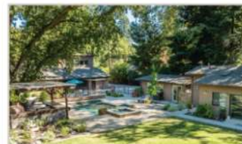
2631 Danville Blvd, Alamo 4 Bd | 5.5 Ba | 4507 Sqft | $1,995,000

This beautifully maintained home in the heart of Upper Rockridge boasts stunning Bay views, an abundance of natural light, & classic architectural details!