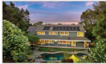
291 Monte Vista Ridge Road, Orinda 5 Bd | 4.5 Ba | 5576 Sqft | $4,250,000

This private retreat is above it all offering unobstructed sweeping views out nearly every window!