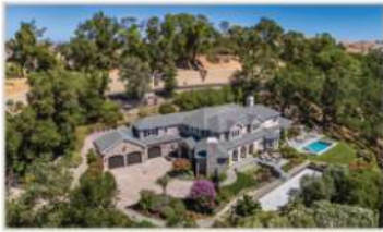
27 Orinda View Road, Orinda 5 Bd | 5.5 Ba | 5335 Sqft | $5,150,000

This private retreat is above it all offering unobstructed sweeping views out nearly every window!