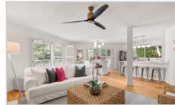
76 La Cuesta Road, Orinda 3 Bd | 2 Ba | 1762 Sqft | $1,395,000

This home is one of the most desirable in Orinda Grove due to its location, 10' ceilings, pristine condition & fab floor plan on one level.