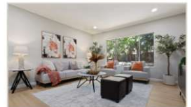
1167 Kaski Lane, Concord 4 Bd | 3 Ba | 2237 Sqft | $1,149,000

This rare opportunity features an amazing .6 acre flat, gated lot backing to the Iron Horse Trail in prime westside Alamo!