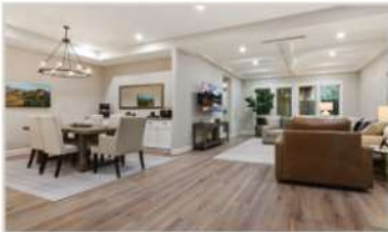
3235 Mt. Diablo Blvd #104, Lafayette 2 Bd + Office | 2 Ba | 2148 Sqft | $1,895,000

Stylish retreat in Happy Valley hills offers a sparkling pool, wine room, greenhouse & views from every room all on 1+ acre!