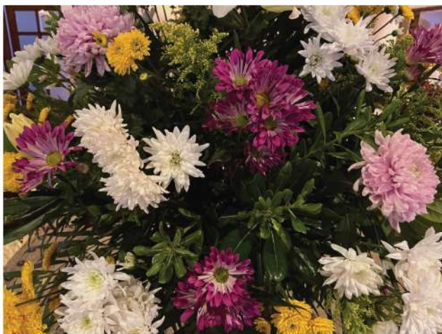
A variety of colorful chrysanthemums with greens of mock orange make a fragrant floral display.