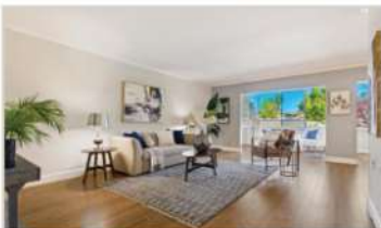
1200 Leisure Lane Unit 4, Walnut Creek 2 Bd | 1 Ba | 1262 Sqft | $450,000

Enjoy this lovely, bright unit which fits laminate flooring, quartzite countertops & an open atrium patio!