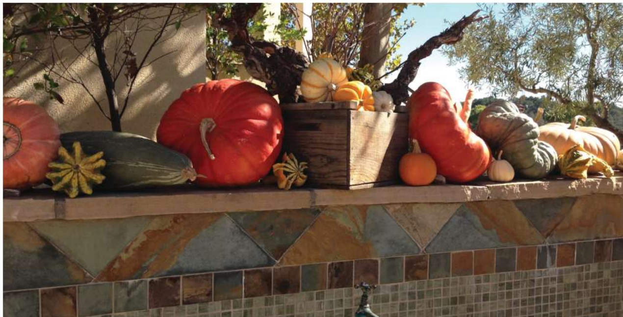
A fountain decorated for fall with pumpkins, gourds, and squash.

In Japan, the chrysanthemum is revered for its blooming beauty representing perfection and rejuvenation. The Kiku Matsuri or Chrysanthemum Festival honors this noble plant with the Imperial family using it as the respectful image of their lineage.