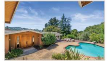
11 Idyll Court, Orinda 6+ Bd | 4.5 Ba | 4020 Sqft | $2,695,000

In the heart of the OCC neighborhood, this custom home offers breathtaking views from the glass walled veranda!