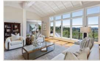
24 La Campana Road, Orinda 4 Bd | 3 Ba | 3858 Sqft | $3,495,000

Experience luxury living in this modern architecture masterpiece, designed by Bud Evenson & stylishly remodeled in 2015.