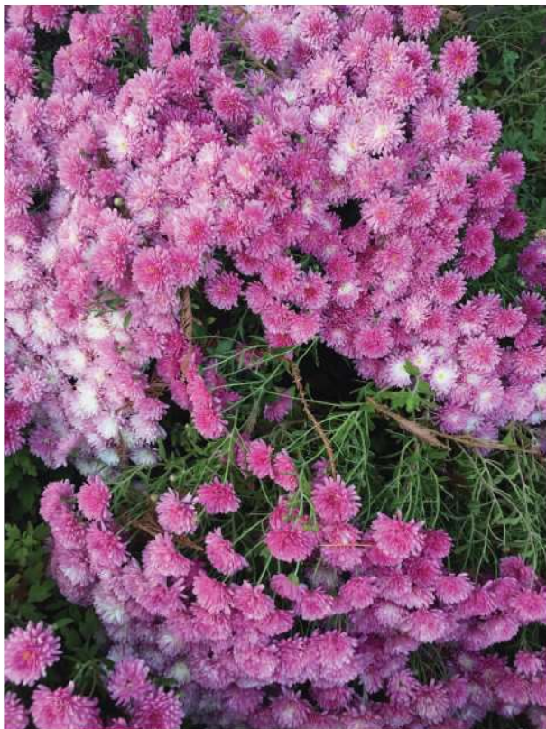
A bush of purple mums.