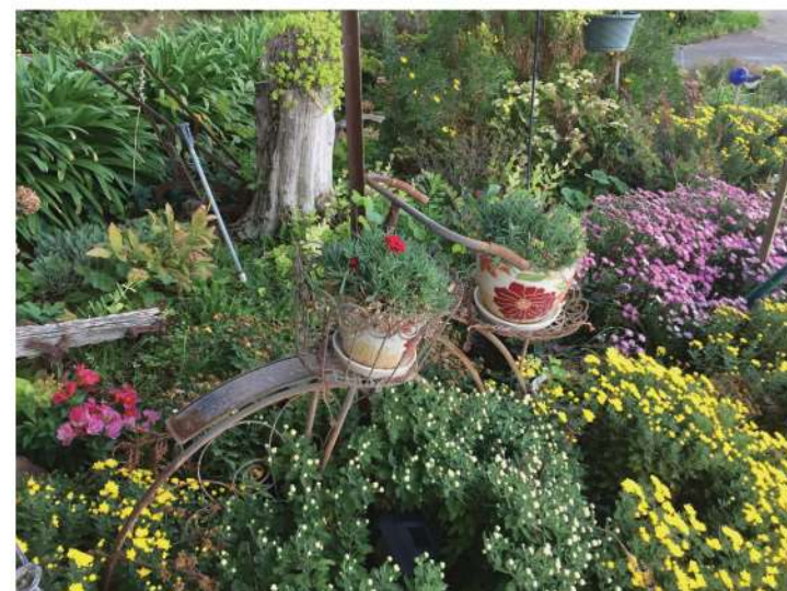
This garden boasts a variety of mums in the bud.