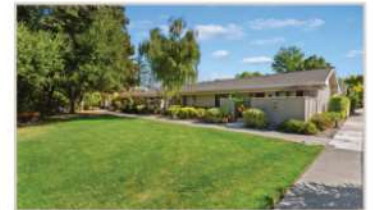
1600 Oakmont Drive #6, Walnut Creek 2 Bd | 1.5 Ba | 1058 Sqft | $550,000

This centrally located Waterford condo offers an open floorplan & the ideal blend of comfort and convenience!